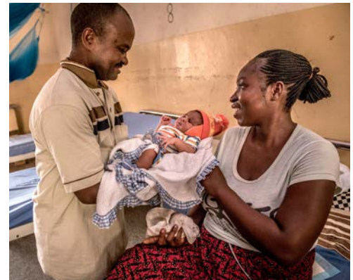
Male birth companion celebrates the birth of his child with his wife.