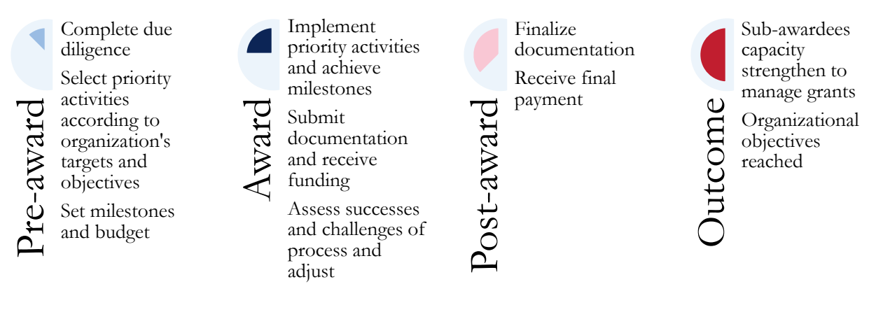
Figure I: FAA Implementation Pathway

The FAAs had a very specific SOW, with clearly defined deliverables and timelines. The corresponding costs were clearly identifiable as required by USAID's Automated Directives System (ADS) 303.3.24.1. Each award was less than the threshold amount of $120,000. Figure 1 provides an overview of the process of awarding and executing an FAA.