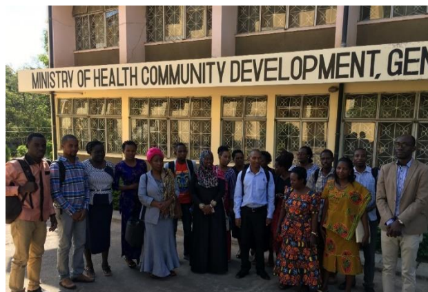
Immunization PSE orientation in Kagera and Mara Regions.