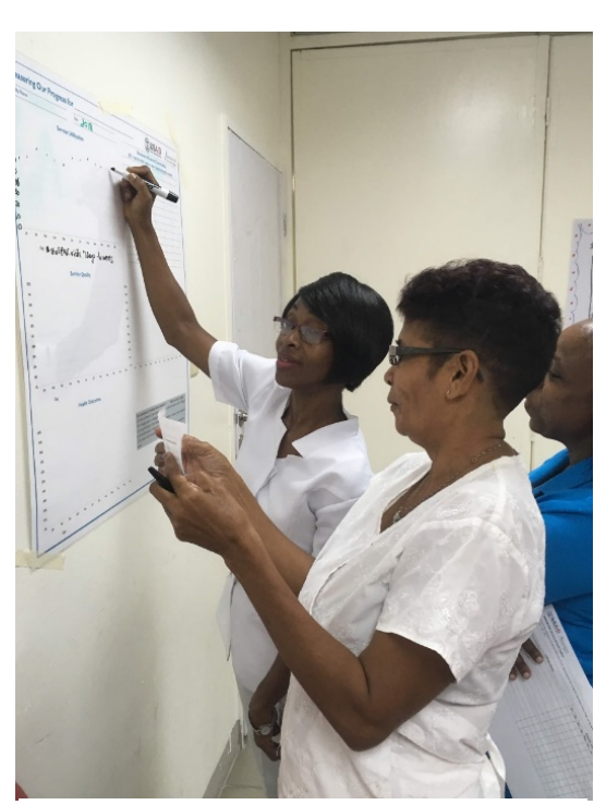
Two nurses from Guyana Region 5 clinics learn to chart data for visualization purposes. These nurses are point people for quality improvement at their facilities and use the charted data to understand trends in key aspects of service delivery.

Timely, high-quality PNC is critical to ensure all women and infants receive comprehensive monitoring and key preventive and therapeutic interventions. In the context of the recent epidemic, health systems must ensure that families receive important Zika-related counseling and that infants born to mothers with possible Zika virus exposure during pregnancy receive a standard health assessment at birth, well-child visits, and specialized evaluations. Health assessments should include a comprehensive physical examination, vision screening, developmental monitoring and screening, and