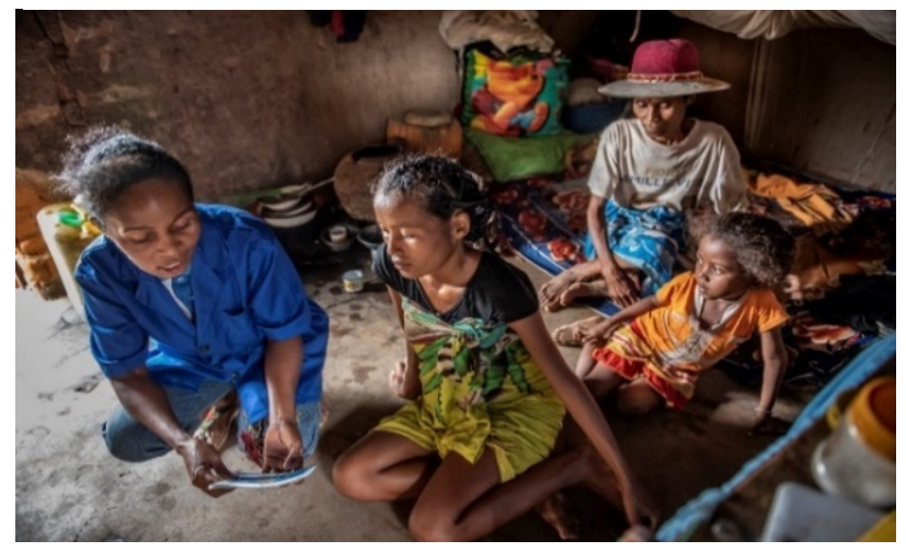
Activities in Mozambique

In Mozambique, MCSP used a similar approach to create a contextually adapted package of adolescentgeared RMNCH services. In lieu of formative research, a process of community consultations exploring the needs of FTPs and the factors that shape health care seeking in Nampula and Sofala Provinces in Mozambique revealed the need to engage male partners, address harmful gender norms, build intracouple communication, and encourage male involvement in family planning and parenting. Using this critical feedback, MCSP adapted Save the Children's <u>My First Baby</u> initiative to include male partners, calling the reframed, gender-synchronized package Our First Baby .