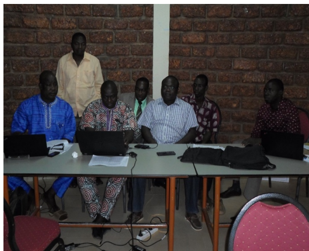
Regional and district health teams attend a RED/REC training-for-trainers workshop.

One hundred forty-six people were trained on RED/REC with MCSP support, including three EPI focal points and two EPI deputies in Center, Center-East, and East Regions; 43 DMT members in Baskuy, Sig-Noghin, Pouytenga, Zabré, and Manni districts; and 98 chiefs of public and private health facilities. A specific area of focus for capacity-building during trainings was development of district and health facility microplans. A microplanning template was developed to aid participants in: district/health facility catchment area map preparation and updating; identification of health centers and location of priority communities; identification of client barriers in accessing and using immunization services; identification of solutions to overcome challenges; preparation of work plans and plans for immunization sessions, including strategies for improving vaccination in the second year of life.