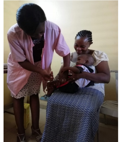
Child receiving vaccination.

In response to these findings, the MOH Department of Prevention through Vaccinations (DPV), with MCSP's support, developed a strategy to build the skills of staff responsible for planning, implementing, and monitoring the Expanded Program on Immunization (EPI) in MCSP-supported regions, districts, and health facilities. This strategy included: 1) updating national RED/REC training materials; 2) conducting updated RED/REC training for regional/district-level trainers and cascading updated training down to health workers; 3) supporting capacity-building and implementation of data quality-self-assessments (DQS); and 4) providing technical and financial support for supportive supervision. Skills-building focused on improving participants' ability to: effectively organize and deliver routine immunization services in their catchment areas; optimize use of available EPI resources; enhance the quality of RI data; and ensure equitable and sustainable immunization access for target beneficiaries in all communities.