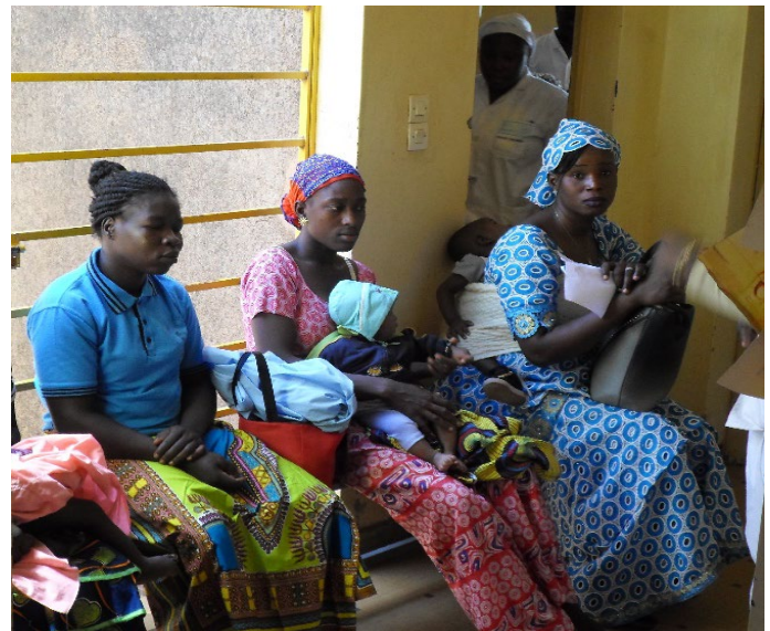
Mothers and children waiting for vaccination session at Health Facility.

Burkina Faso is investing great effort in strengthening routine immunization (RI) services nationwide, with the goal of increasing vaccination coverage, improving equity in immunization service delivery, and reducing missed opportunities to vaccinate high proportion of children. Despite indications of high vaccination coverage rates nationally (e.g. 2016 World Health Organization/UNICEF estimates showing national DTP3 coverage above 80%), national figures mask regional- and district-level disparities and pockets of low coverage. For example, 2010 Demographic and Health Survey data indicated that in some regions the percent of children who were completely vaccinated was above 90% (e.g. Center-East, Center-North and Center-South) while in other regions the percent of completely vaccinated children was around 65% for the same period (e.g. Sahel and Cascades). Burkina Faso's efforts to strengthen its RI program and increase equity of vaccination coverage include implementation of the Reaching Every District/Reaching Every Child (RED/REC) approach which focuses on five operational components: 1) planning and management of resources; 2) reaching all eligible populations; 3) supportive supervision; 4) linking services with communities; 5) monitoring and use of data for action.